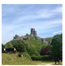
Corfe Castle – and locals – by Louise Werran